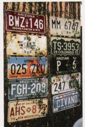
Colorful accents play a large role in the Calhoun landscape.

Three goals were the guiding forces as they created their landscape. Goal one, the gardens would celebrate native plants. As an example, native annual