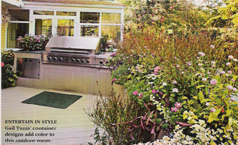
ENTERTAIN IN STYLE Gail Tunis' container designs add color to this outdoor room.

Trend: Some of the designs, as shown, are “splashy” and meant to be appreciated from a distance as you walk toward them. On closer inspection, lots of smaller plants provide interesting detail. Dan says that an important trend in container gardening is using architectural plants with great foliage. Here the hanging basket is 24 inches in diameter, and fully grown is 42 inches wide. The sago palm adds height to reach an overall 36 inches. It’s in full sun all season and rotates gently on its hanging chain, making all sides visible to the eye.